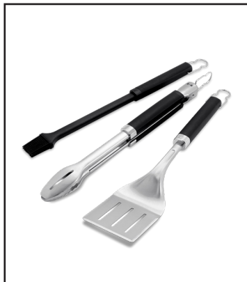
Precision tool set This premium set of tools, all with soft touch handle, includes a 3-sided beveled edge spatula, hands-free locking tongs and full-size silicone basting brush.