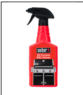
All purpose cleaner Keep your Weber barbecue looking its best. Its unique formula will remove grease, fat and smoke stains, to keep your barbecue clean.