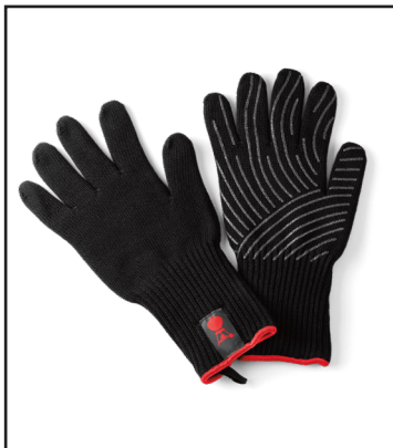
Premium gloves Protect your hands from a hot barbecue and keep a good grip on your barbecue tools with the silicone palms.