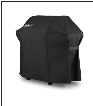
Spirit BBQ Cover This weather-resistant cover will keep your barbecue in top-shape and comes with fastening straps to keep it secure even in windy conditions.