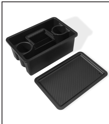
Weber Works Caddy with Tray Lid Transport items easily from the kitchen to the griddle with the Weber Works™ Drop-in Caddy with Tray Lid.