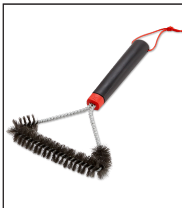
Small grill brush This three-sided grill brush is made to remove grease and debris from cooking grills of all sizes. The handle design provides a secure grip when brushing off stuck-on food or cleaning tight spaces.