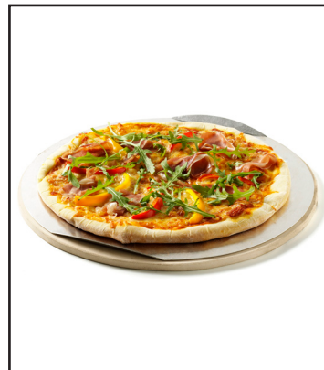
Pizza Stone Large Enjoy crispy gourmet pizzas in your own backyard. The easy serve pizza tray makes it simple to handle pizzas going onto, and coming off of, the barbecue.