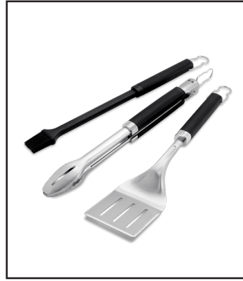
Precision tool set This premium set of tools, all with soft touch handle, includes a 3-sided beveled edge spatula, hands-free locking tongs and full-size silicone basting brush.