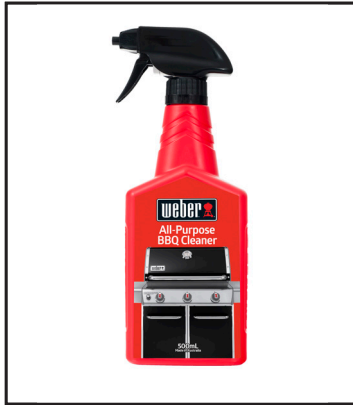
All purpose cleaner Keep your Weber barbecue looking its best. Its unique formula will remove grease, fat and smoke stains, to keep your barbecue clean.