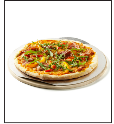
Pizza Stone Large Enjoy crispy gourmet pizzas in your own backyard. The easy serve pizza tray makes it simple to handle pizzas going onto, and coming off of, the barbecue.